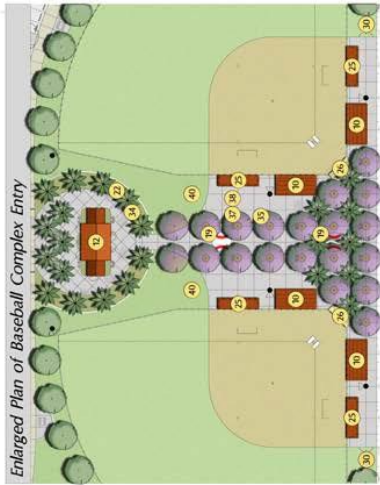
EXHIBIT 2 – RANCHO LAS FLORES PARK